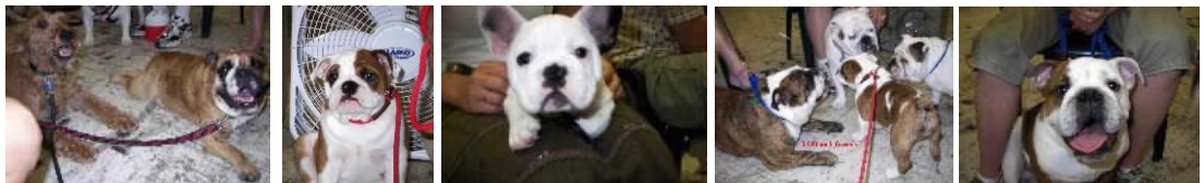
A few pictures from the July gathering...

Back issues of this newsletter are available on the web at: